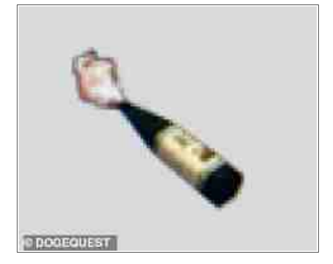
The site uses an image of a Molotov cocktail as its cursor

Five protesters were arrested for disorderly conduct at the Manhattan demonstration